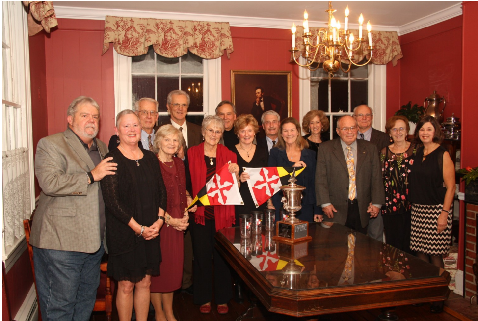
Cruisers celebrate at the Annual Gala

Now it's time to start thinking about the 2019 cruising season. On Saturday, January 5, with temperatures in the 40's, 26 cruisers and future cruisers gathered in the clubhouse to plan the 2019 cruise schedule. As a result of that meeting, 14 cruises, ranging from two days to almost two weeks and with destinations from top to bottom of the bay and including Cape May, New Jersey, have been placed on the SMSA calendar. Cruises begin in April and continue until the end of October. Cruise Leaders are busy finalizing details for each cruise and these will be printed in the 2019 Yearbook. All SMSA members are welcome to participate in the cruising program.