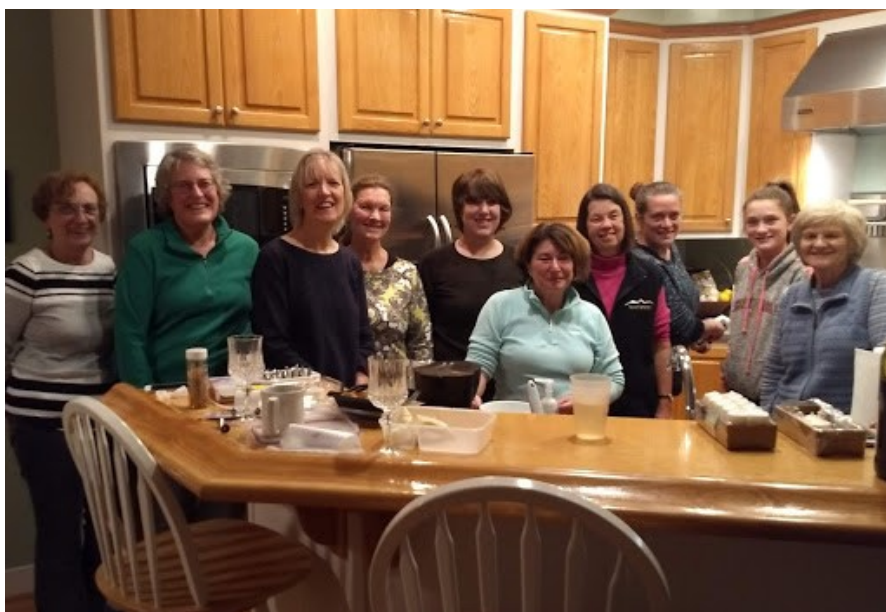
Some of the Gala volunteers after cookie and cupcake decorating!