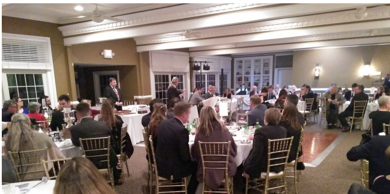
Annual Gala Opening Remarks