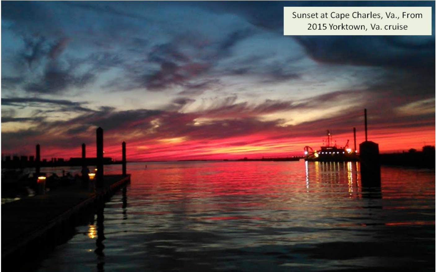
Sunset at Cape Charles, Va., From 2015 Yorktown, Va. cruise