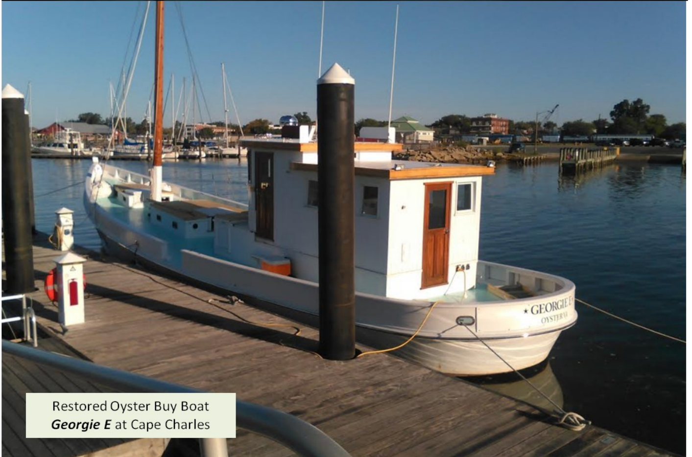
Restored Oyster Buy Boat Georgie E at Cape Charles