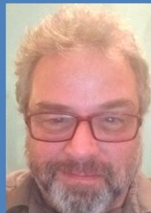
2016 Santa Claus beard growing contest competitor