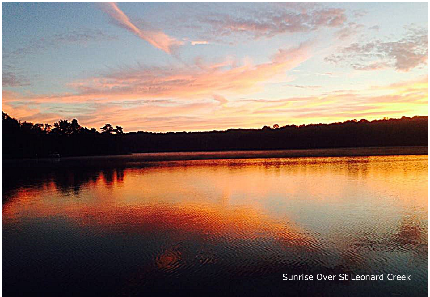
Sunrise Over St Leonard Creek