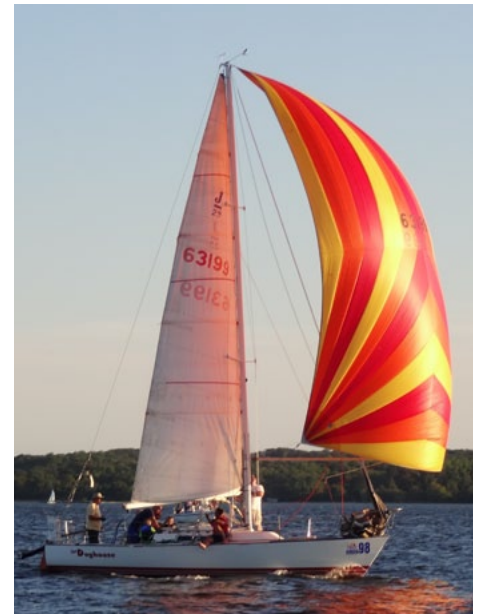
Wednesday July 25