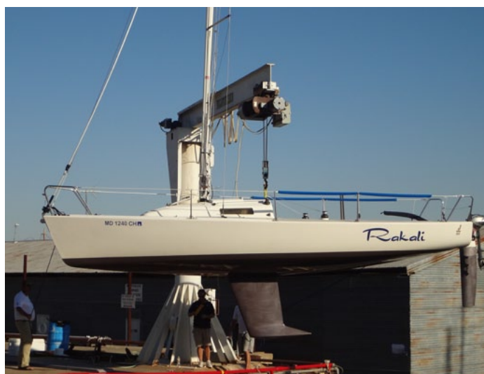
Rakali all ready to sail in Texas

We spent Tuesday leisurely assembling the boat, then treating her to a wet-sanding, full top-to-bottom and fore-to-aft bath, then finished up with a wax job. Pamper your boat every now and then -- she'll love it!