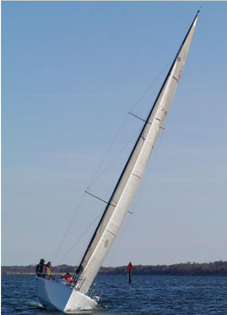
Rhumb Punch, Fall Frostbite Winner