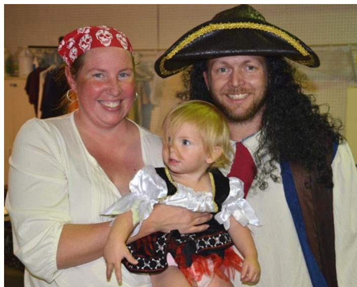
The Pirate Commodore and his Family