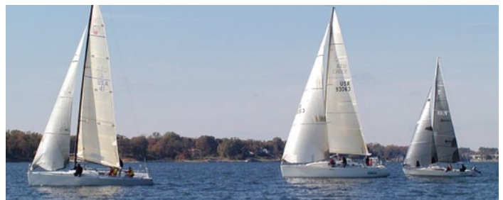
Rhumb Punch, Crocodile and Wicked Good in Frostbite #1

It's been a VERY good season. Informal race participation continued as our most popular events to break up early spring and late fall weekends and most of our sailing season work-weeks. Weekend formal race participation was up for almost all of the events and the competition was tight with boats from each of the classes placing in award-winning spots as our club continued its spinnaker-centric participation from 2011 through the 2012 season. Thanks to all the boat captains for their financial and time investments and for ALL the many crewmembers who help captains get around the course. It's always fun and challenging to be with you on the racecourse. Thank you for your participation and congratulations to all of our award winners. See you all at the banquet.