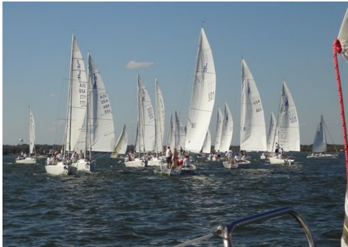
The line is a busy place

on a fresh-water lake). And pulling current out of the equation altogether is another plus to lake sailing.