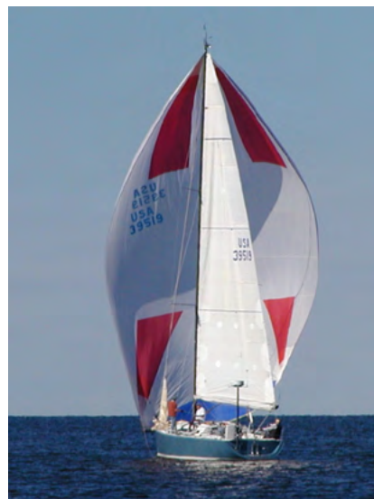
American Flyer - First to Sharps

It was a beautiful day for the last Middle Distance Race of the season, Sharps Island. The fleet got off on-time, into a very light northerly with the tide going from slack to flood. After we passed Cove Point the wind went to nothing for an hour or so. Of course it is rarely totally nothing. This time "nothing" was 0-2 knots switching from the east to the west on about a 10 minute cycle, during which we enjoyed at least six sail changes or gybes. Eventually we could see the boats astern getting a light southerly which they kindly brought with them while we were parked. We managed to hold off everyone but American Flyer (It's great to have you out again, Dan.) rounding Sharps second with everyone else way too close. As we approached Sharps we were having a hard time deciding between the light #1 and heavy #1. Luckily we choose correctly, the heavy #1. It was a solid beat with good southerly breeze all the way back to the finish. Bad Cat slipped by but we opened up nicely on the rest of the fleet, finishing in the chill of a fall evening just before 2000.