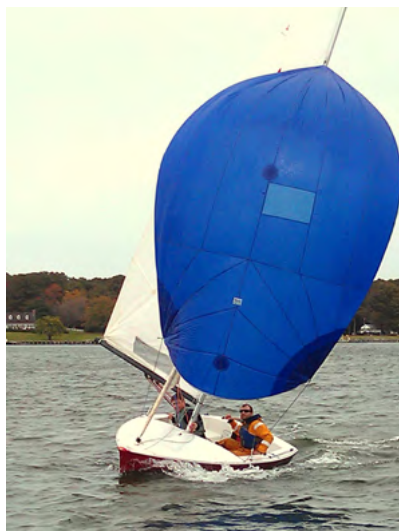
What happens next?

To give you an idea of what is a little different about this event, we will take a closer look at the how it works. First of all when sailors cross tacks in this event the rules dictate the boats to shout Arrgh! if crossing, or to shout Quack when ducking. Also the regatta is scored a little differently. We score the event on a High Point system, the team with the MOST points at the end of the day wins. You get a point for every boat you beat in a given event, as well as other contests such as who can bring in the most new crew, or who gets to the dock first. In an effort to level the playing field the regatta is also seeded, and you get the points for your seed, so the 12th seed boat starts with 12 points, and the first seed boat starts with 1 point. The first race of Bucctoberfest is from the dock, to the starting area. Sure, we all know that every regatta starts this way, but this regatta awards points to the teams that get there first! From there we start turning things around a little.