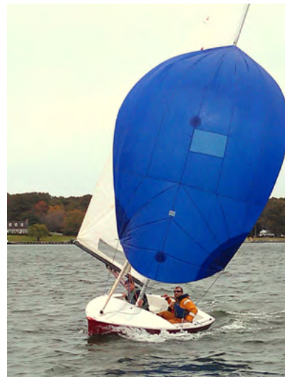
What happens next?

To give you an idea of what is a little different about this event, we will take a closer look at the how it works. First of all when sailors cross tacks in this event the rules dictate the boats to shout Arrgh! if crossing, or to shout Quack when ducking. Also the regatta is scored a little differently. We score the event on a High Point system, the team with the MOST points at the end of the day wins. You get a point for every boat you beat in a given event, as well as other contests such as who can bring in the most new crew, or who gets to the dock first. In an effort to level the playing field the regatta is also seeded, and you get the points for your seed, so the 12th seed boat starts with 12 points, and the first seed boat starts with 1 point. The first race of Bucctoberfest is from the dock, to the starting area. Sure, we all know that every regatta starts this way, but this regatta awards points to the teams that get there first! From there we start turning things around a little.