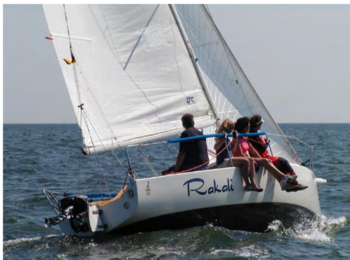
Rakali during the Fall Series