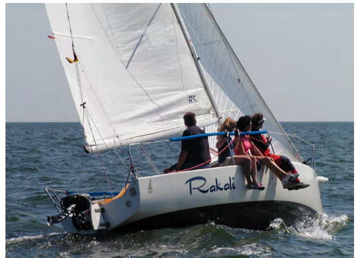
Rakali during the Fall Series