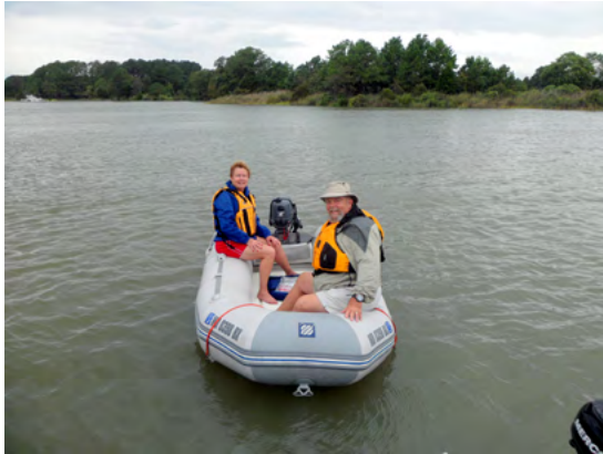
Visitors Arriving by Dinghy

Our cruise started with a very windy Saturday with 6 knots of wind in the slip, 15 knots of wind in the river and 25 to 30 knots out of the North and 3 to 5 foot waves in the Bay. To make our trip more comfortable we put a 50% reef in the main and tacked up the Bay. Patty K braved the weather but we decided to cut the day's distance short with a run into Hudson Creek on the Little Choptank River. Of course, once we sailed into the Little Choptank River the weather became much more acceptable. We anchored near our regular anchorage and were joined by seven other boats seeking refuge from the Bay.