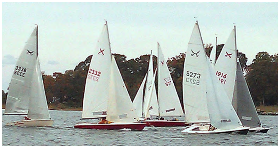
Crowded mark rounding at Bucctoberfest

You've by now received your ballots to see a full slate of volunteers for officers and directors. The Annual Meeting is 10:00 am Saturday Nov 3 at the SMSA clubhouse. The SMSA team has been working on preparing a budget and schedule to conclude 2012 with a strong program and bring in an even better 2013.