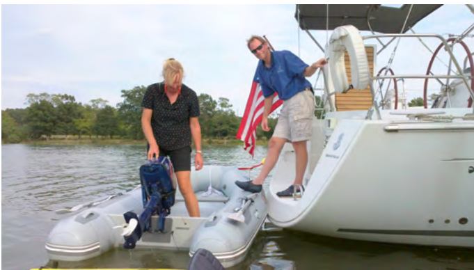
Ready to go Ashore