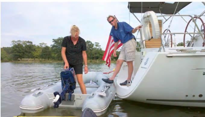
Ready to go Ashore

Day two the cruise really got underway with Piper and Carpincho joining Patty K and taking up an anchorage in Baby Owl Cove, off of Ledenham Creek, off the Choptank River. Happy hour was calm and very enjoyable. Before dark we broke the raft and anchored separately.