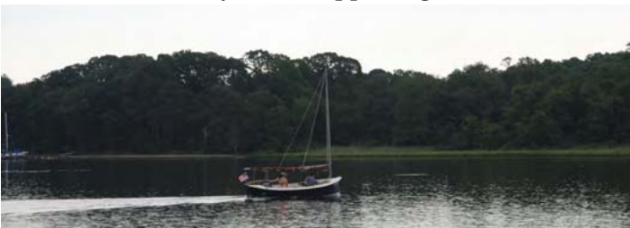
OGGIE Heading Home on Sunday Morning

Happy hour food and beverage continued into the evening on several boats as a few boats left the party for home port. With calm winds forecast for the night and several anchors down, a substantial number of boats remained rafted overnight, while a few others broke off to anchor separately. Overall I believe I counted 16 boats for the overnight stay. Morning greeted us with a slightly overcast sky as various breakfast odors wafted about the cove. Boats peeled off the raft and/or weighed anchor throughout the morning as they left Battle Creek behind and made their way back toward Solomons in a breeze that had shifted SE so it was on the nose for most of the trip home. A great time was had by all as member participation in this annual event exemplify the foundation of SMSA's charter for on-the-water fun involving racing, cruising, and social activity - all happening at one time.