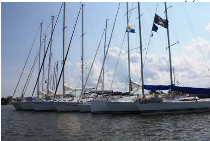
Front Side of the Raft

weather for our 10 mile race/cruise from Sandy Point to Battle Creek. Sixteen keelboats and 5 small boats participated in the informal couple's race from Sandy Point to Battle Creek. Prior to the 1000-1030 start window there was a lot of activity behind the line as the boats contemplated their own starting tactics. Stingray was the first boat to venture across the line just after 1000, and then a steady stream of racers/cruisers followed at their leisure. With clear sky and a good breeze from the NNW at about 12-15 knots we enjoyed