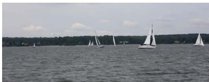
The Couples Fleet beating around Pt. Patience

The group prepared to leave around Noon, and even found some breeze off of Cove Point, adding some sailing to the trip. All in all it was another enjoyable weekend with good friends even though we did less sailing than we would have liked. Who could ask for anything more?