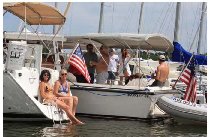
Mermaids at Battle Creek

us the opportunity to enjoy an afternoon of water activities including swimming, bottom/prop cleaning, boat jumping, paddle boarding, noodle floating, and treading water with a can of beer.