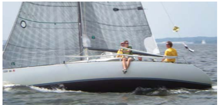
Natural Disaster after the start