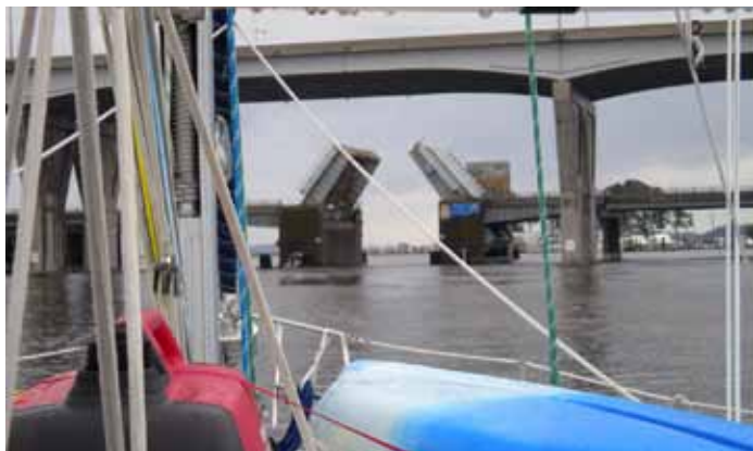
Bridge opening at the Kent Narrows.

Patty and I had a leisurely breakfast aboard before heading into town to spur their economy along. We shopped hard the rest of the morning and then stepped in the Carpenter Street Saloon ($) for lunch. Then it was back to shopping the other side of Talbot Street. We took our booty back to the boat, cleaned up and headed in to Bistro St Michaels ($$$$) for a wonderful supper. We shared a mess of mussels before the main meal; delicious. I had their broiled crab cake and have yet to figure how they were able to cook it; there was no filler, just succulent pieces of crab meat. It fell apart when I stuck it with my fork. Patty had the shrimp and they were great. The service is excellent. We highly recommend this establishment.