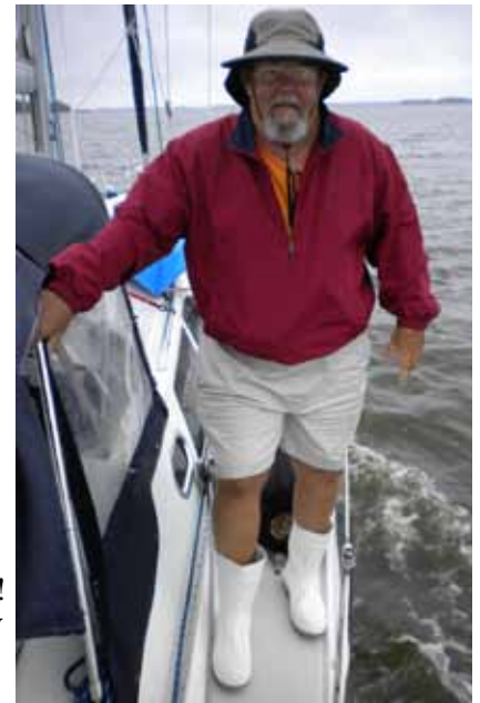
Rich braving the rain in the eastern bay.