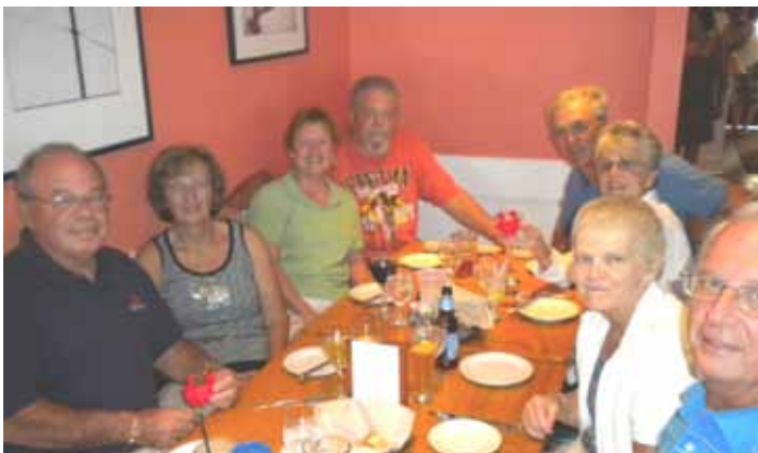
Supper at the Fish Whistle Restaurant near the Chestertown Marina.