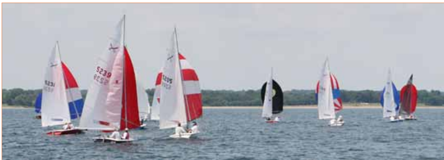
The fleet heading upwind.

Contact Jim Whited, or Jimmy Yurko if you have any questions about upcoming Buccaneer events, we've got boats available to try out.