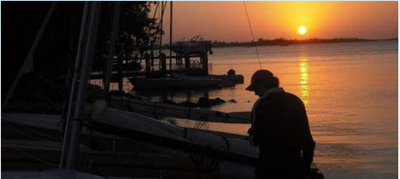
One last systems check before Sunset