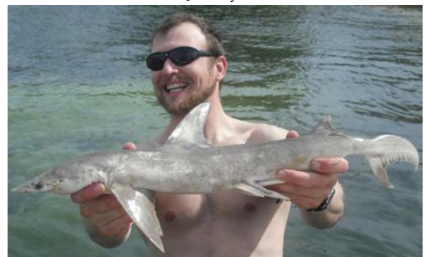
One of Florida's vicious man-eating sharks...capsized hazards!