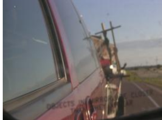
2 boats in tow...doesn't matter where we're going

Neither fleet was lacking competition, the B-Fleet had several accomplished sailors trying to be thrown out, and the A