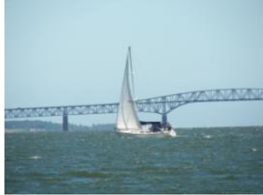
Swan tacking across the Rappahannock river

Sunday: Noon Somewhere, Sequoia, Twice Around, Walkabout, Crash Pad