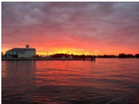
Breathtaking Scenery...Less than perfect sailing conditions

NEXT EVENT: October 24, Chili Party and Oyster Scald, 4:00.