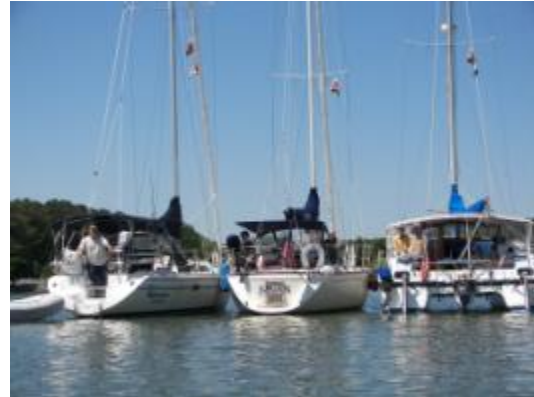
Raft in mill creek

May 18 Departed Annapolis/ Wye River Monday: Noon Somewhere, Sequoia, Twice Around, Walkabout