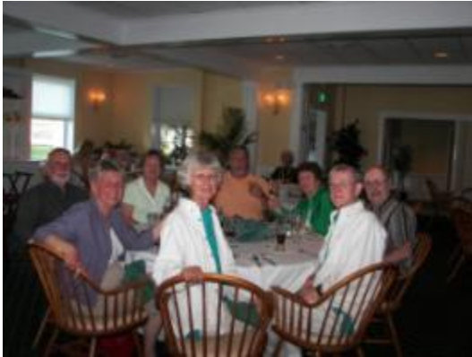
Supper at Indian Creek Yacht Club

Departed Annapolis for St Michaels: Carpincho