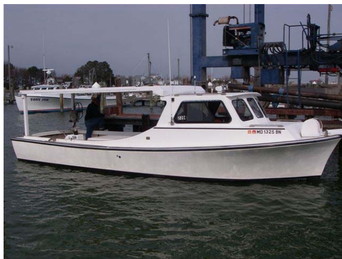
Move over Rock Crusher...Here comes “Strawberry”

The boat, like any, needs to have some maintenance performed to make sure that it will last ( Continued next page )