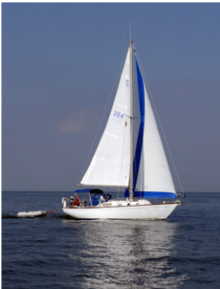
Kalypso sailing in 10-knots

The next day, with the heat index over 105 degrees, Koel, Blue Heron, and Mongoose Magic returned to their home ports, while the rest sailed in 10 knots NNW to the nearby Deltaville Marina, which has a large air-conditioned boaters lounge. Fortunately, a weak cold front moved through the area that evening, and temperatures returned nearer to seasonal levels the rest of the week. On Wednesday, with a 15-20 knot N wind, sailing also improved and the small flotilla headed around Stingray Point up the Rappahannock to a beautiful anchorage in the eastern branch of the Corrotoman.