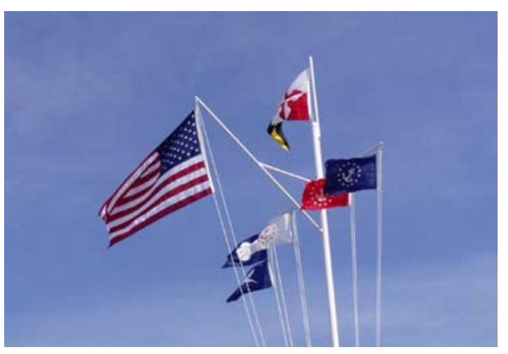
All the flags fly proudly in the wind on the new SMSA flag pole