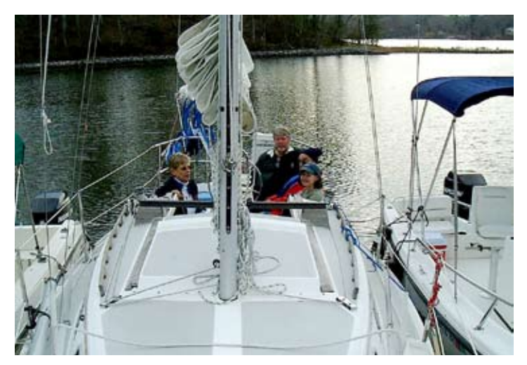
Wavedancer is the largest boat in the raft for the first time, winged by powerboats.