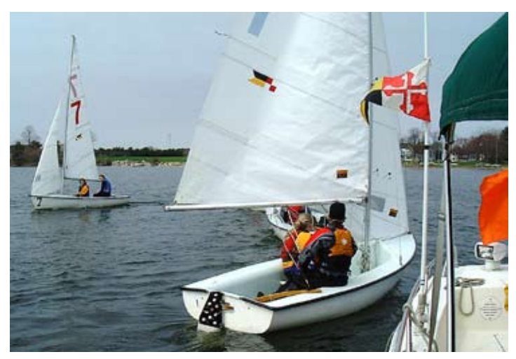
Boats jockeying for position at the start of one of the races.