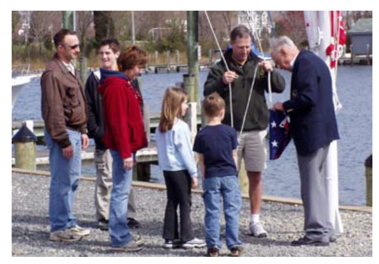
Children of members and guests bend on 'Old Glory'