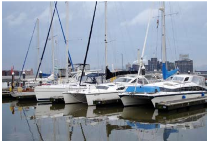
Baltimore's Inner Harbor Marina