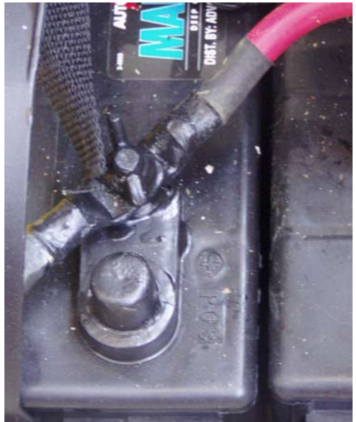
Battery terminals isolated and protected with a coating

Dale Koonce, Mongoose Magic, somewhere on the ICW