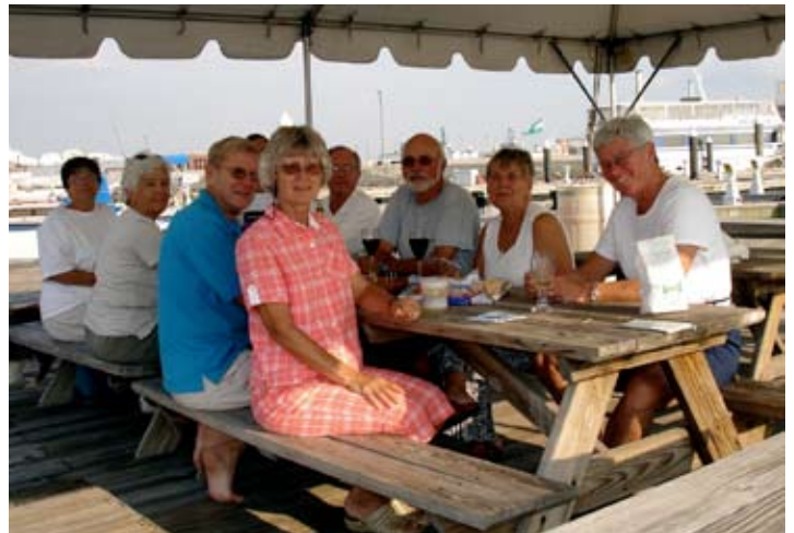
Friends at happy hour