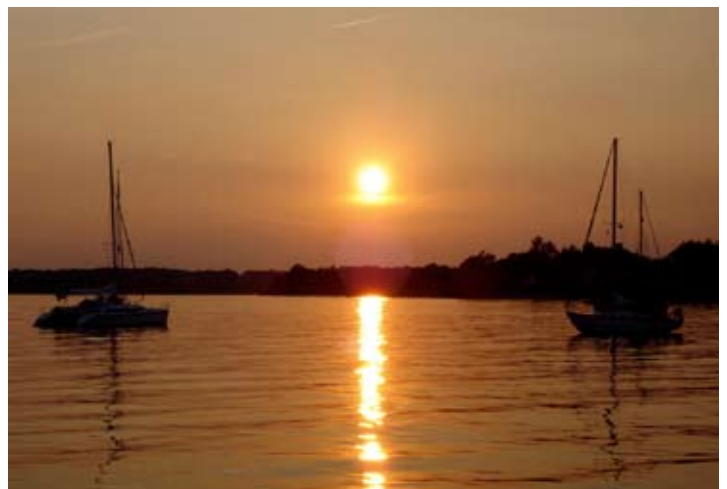
Sunset at anchor