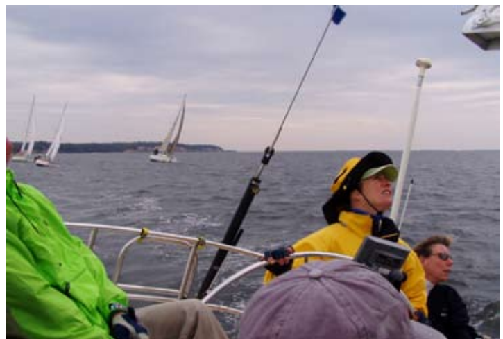
Krugerrand's skipper and crew checking the trim of sails in the 2nd race of the Fall Invitational