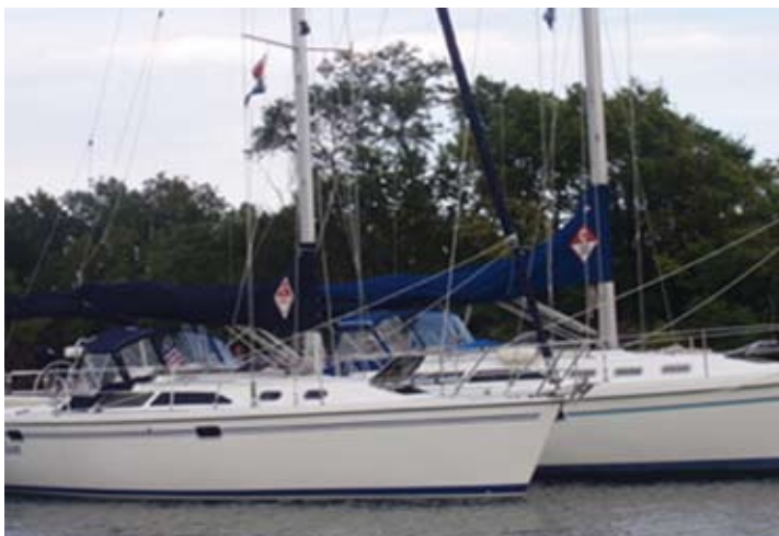
Illumination and Ruste Nayle rafted