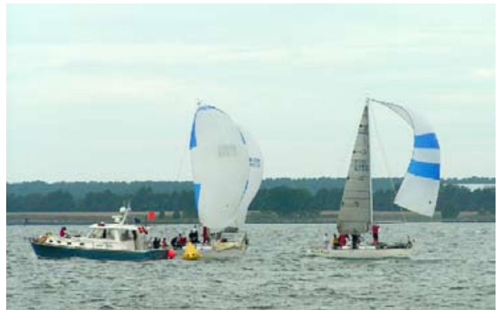
Rhumb Punch gets the gun and bullet on final race