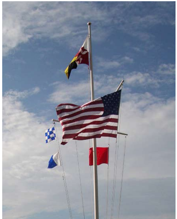
High winds disrupt the 10th Annual Invitational Regatta